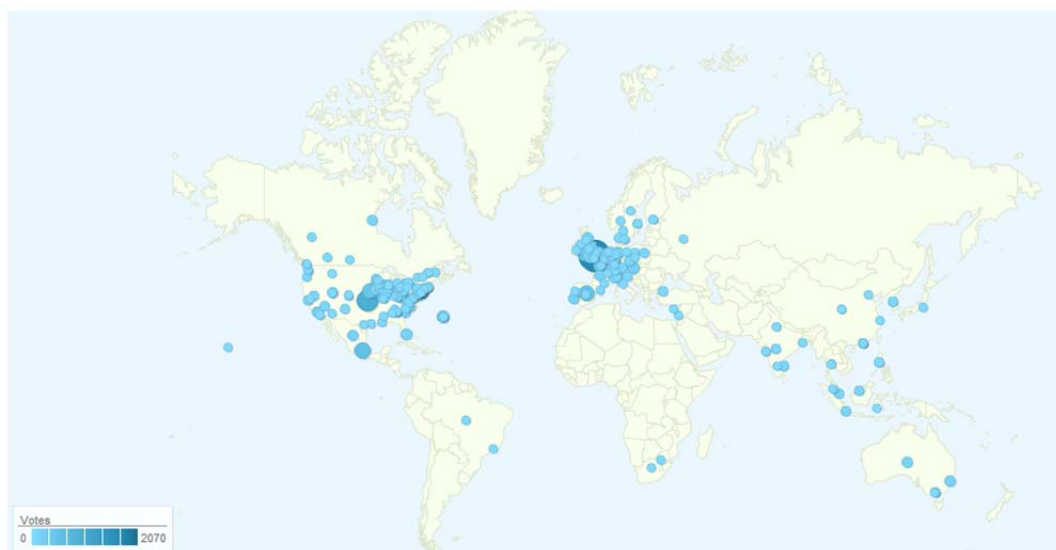
Figure 08: World map of wiki-survey votes

Responses came from all over the globe, as can be seen in Figure 08 .