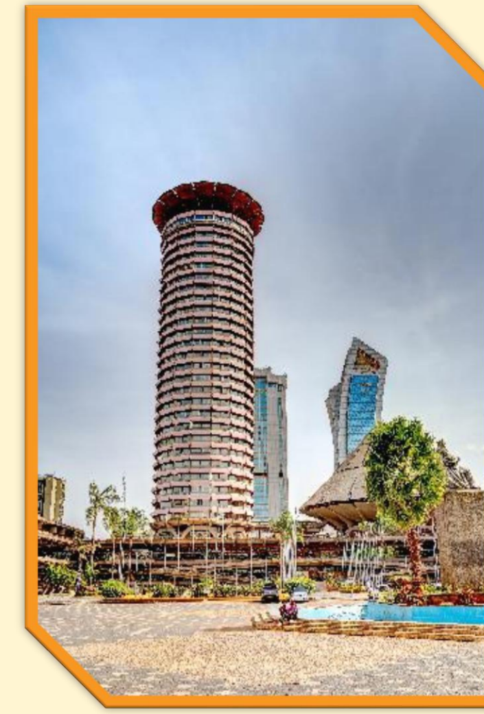
ICA 2029 Nairobi, Kenya June