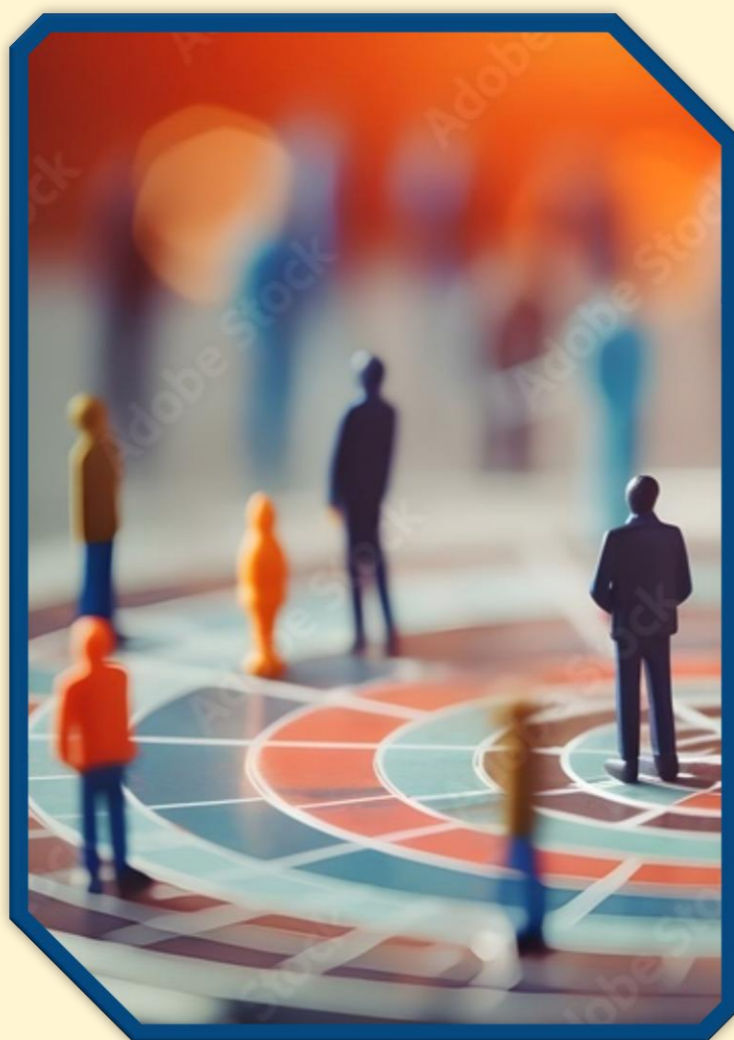
LIFE Colloquium 2025 Online October 8