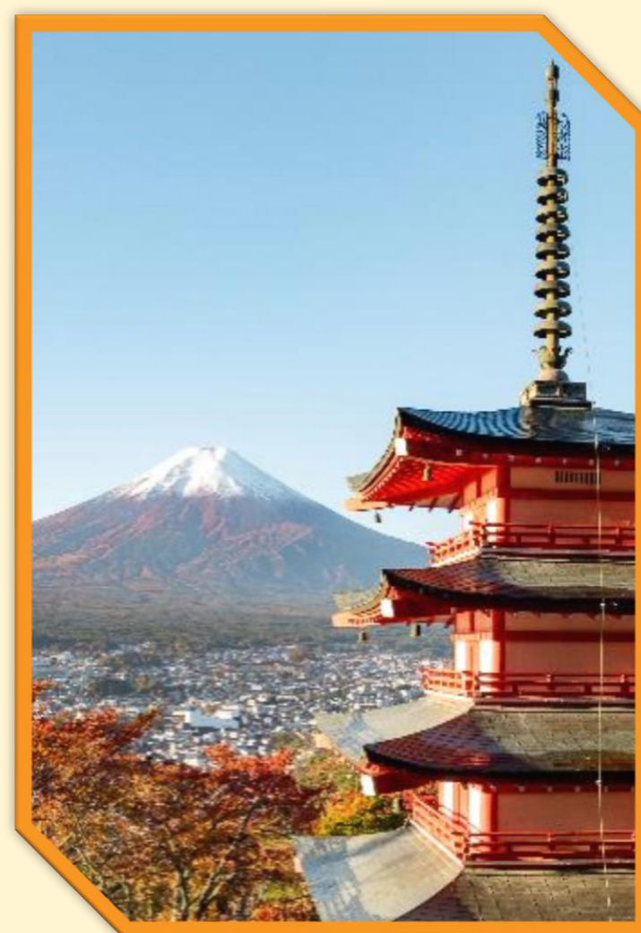
ICA 2026 Tokyo, Japan November 8 to 13