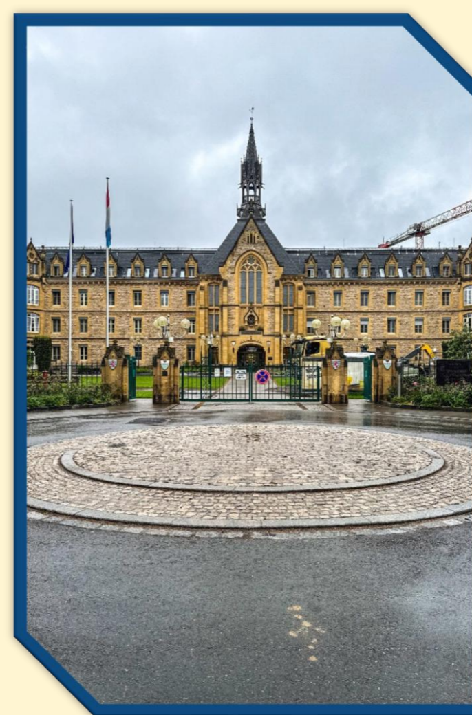
JoCo 2027 Luxembourg September