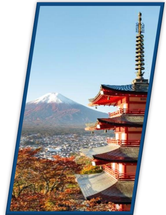
ICA 2026 – Tokyo, Japan November 8 to 13