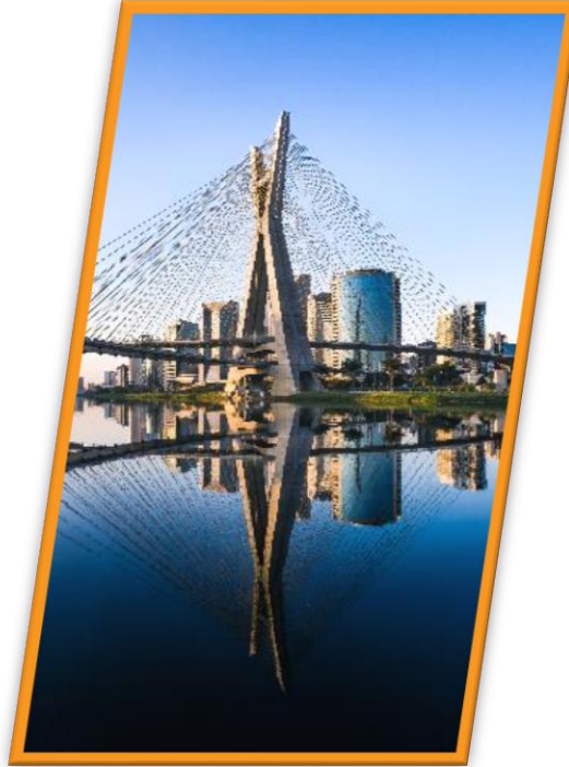
JoCo2025 – São Paulo, Brazil, May 18 to 21