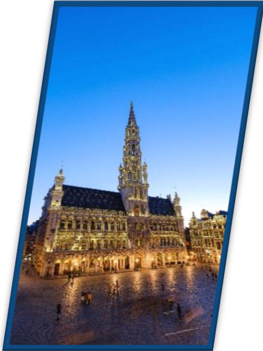
JoCo2024 – Brussels, Belgium September 22 to 26

For Joint Colloquia, we have participated in the organizing committees for: